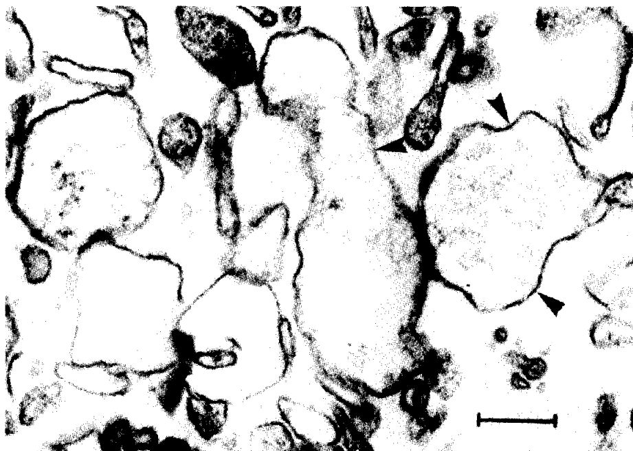
Fig.1. Electron micrograph of purified BRI 8 plasma membrane. The membrane was fixed as previously described [11]. Thin sections were stained with uranyl acetate and lead citrate prior to observation in a Phillips 300 microscope. The arrowheads indicate apparent points of contact between filaments and the membrane bilayer. Magnification: bar represents 0.2 \mu m.

were left at 0°C for 15 min, diluted with 1 ml containing 1 mg of bovine serum albumin, and precipitated with 0.2 ml of 50% (w/v) trichloroacetic acid. After 15 min at 0°C, the precipitates were recovered by centrifugation, washed once with acetone containing 0.1 M HCl, once with acetone and dried. The pellets were oxidized at 0°C for 90 min in 100 \mu l of performic acid (prepared by reacting 0.1 ml of 30% H 2 O 2 with 1.9 ml of formic acid at 22°C for 2 h) and dried overnight. The residues were resuspended in 0.1 ml of 0.1 M NH 4 HCO 3 , digested twice at 37°C for 2.5 h with diphenylcarbamyl chloride treated trypsin (20 \mu l each of a 1 mg/ml solution), dried and dissolved in 20 \mu l of H 2 O. The two samples to be compared were loaded on either side of the midline of a thin-layer cellulose plate (20 \times 20 cm) pre-wetted with pyridine-acetic acid-water (111:3.7:1000, by vol, pH 6.5). Electrophoresis was carried out in the same buffer for 4.5 h at 3000 V and 4°C. The plate was air-dried, cut along the midline, and subjected to chromatography (solvent: H 2 O-acetic acid-pyridine-butanol, 143:50:143:204,